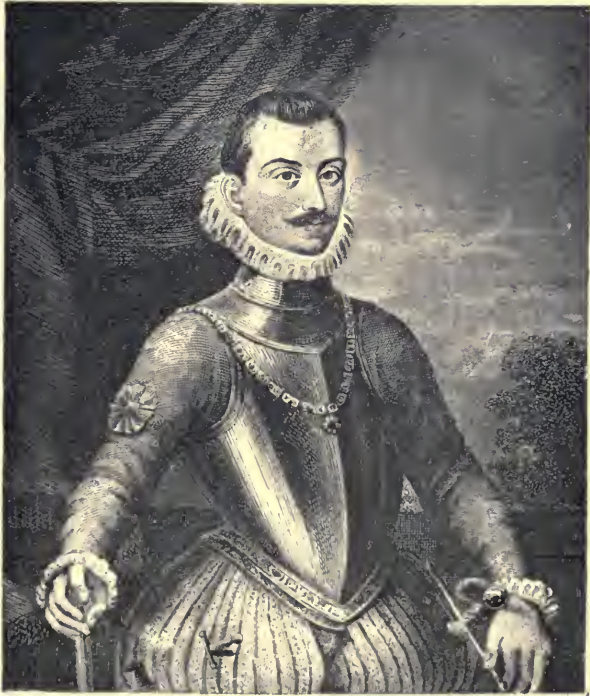
DON JOHN OF AUSTRIA.